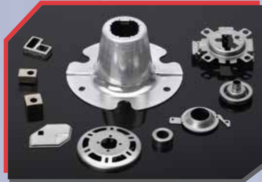
Deep Draw Components