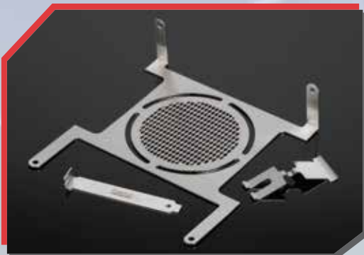
Thin Gauge Precision Stamping