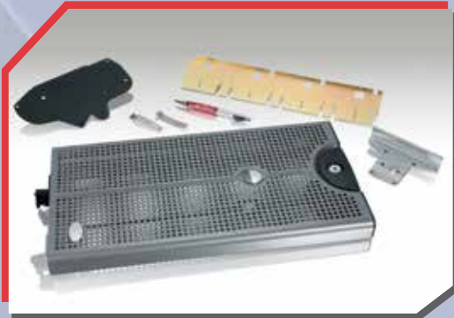
Back Panel and Brackets

“Your Company is as capable as any I have encountered in my 38 years in aerospace” Aerospace Customer