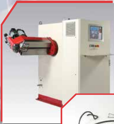
CNC Rod & Wire Forming