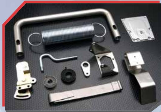
Spring, Rod Form, Covers