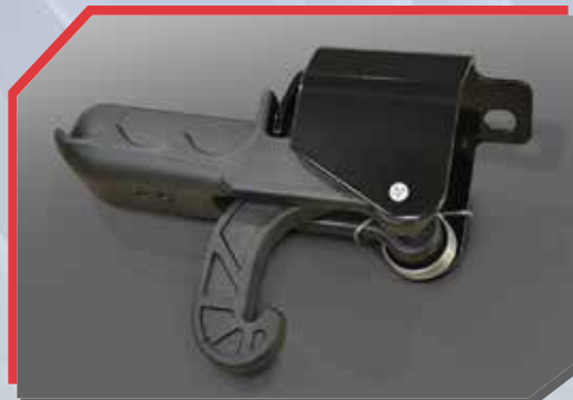
Release Handle Assembly

“From RFQ to product delivery, the single thing I value most is constant communication. Your entire staff is dedicated to my satisfaction” Aerospace Customer