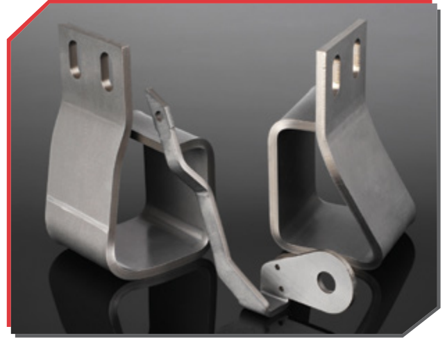
Laser Cut Heavy Trucking Parts